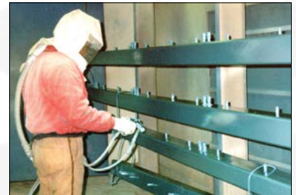
Applying a coat of paint.

As outlined in the synergistic effect section, an important advantage of painting over galvanizing is the extension of the maintenance cycle. In addition to an extended maintenance-cycle, painting on a galvanized surface also facilitates the maintenance repainting. As the paint film weathers, the zinc in the galvanized coating is present to provide both cathodic and barrier protection until the structure is repainted. The exposed zinc surface then can be repainted with minimal surface preparation.