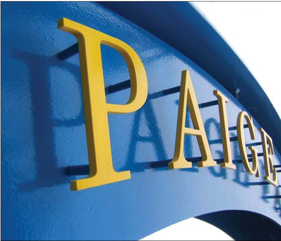
A playful, brightly colored duplex sign marking the entry to Paige Memorial Park in Boston, Massachusetts